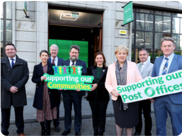
Minister Heather Humphreys announces the reinstatement of jobseeker payments at post offices providing support to those in need.

Together, we need to think creatively and ambitiously about the future direction of the post office network and secure it for another generation.