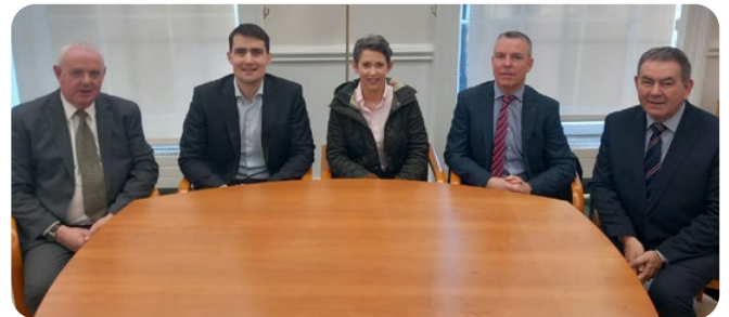
Our first meeting with Jack Chambers, Minister of State with special responsibility for Postal Policy.

We look forward to working with government towards a renewed commitment to providing more services through the trusted, national Post Office network, ensuring ease of access to government services for Irish citizens and sustainable businesses for postmasters in the future.